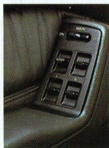
Controls for the power windows are within easy reach of the driver.

For acoustics that will rival any concert hall, have a seat. With the Honda/Bose Music System, exclusively designed for the Accord SEi 4-Door Sedan, every drive becomes an engaging musical experience.