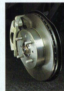
To stop you with confidence, the Accord SEi Sedan features 4-wheel disc brakes.

For refined power, the SEi has a 2.0 liter, 120 hp, SOHC engine with Programmed Fuel Injection. And an available 4-speed automatic transmission.